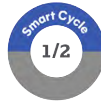
Pre-Transfer Embryology Services