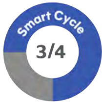
IVF Fresh Cycle

Visit the Explanation of Covered Treatments & Services section of the Member Guide to learn more about what's included in each Smart Cycle and additional covered services. Unless specified, the stated Smart Cycle value for treatment is applied in full, even if you choose to forego any included services. For a full explanation of what's covered under each Smart Cycle, visit the Definitions for Covered Services section.