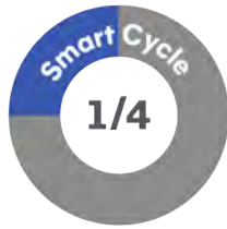
Frozen Embryo Transfer (FET)