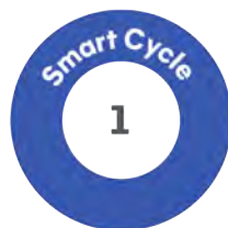
Purchase of 1 Cohort of Donor Eggs 6-8 eggs