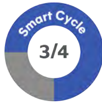
IVF Freeze-All Cycle