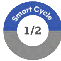
Frozen Oocyte Transfer (FOT)